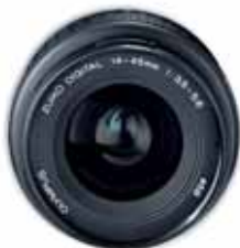
Attached lens: avoids dust getting inside camera body.