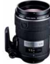
ZUIKO DIGITAL ED 150mm 1:2.0 (300mm)*