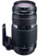
ZUIKO DIGITAL ED 50-200mm 1:2.8-3.5 (100-400mm)*

The line-up of Olympus ZUIKO DIGITAL lenses extends from the Standard Series for demanding all-round applications of ambitious hobby users; through the bright, dust and splash-proof, high-performance models of the Pro Series; to the extremely bright lenses of the Top Pro Series for the highest professional requirements.