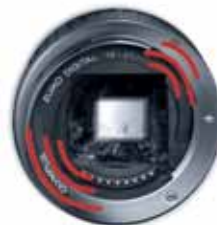
Activation of the Supersonic Wave Filter: the dust particles are shaken off.