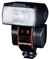
FL-36 Electronic Flash