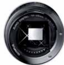
Clean image sensor: no dust particle can affect image quality.