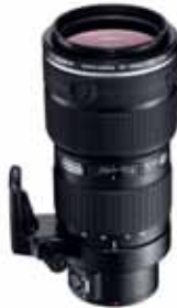
ZUIKO DIGITAL ED 35-100mm 1:2.0 (70-200mm)*