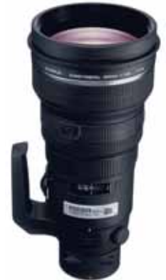
ZUIKO DIGITAL ED 300mm 1:2.8 (600mm)*