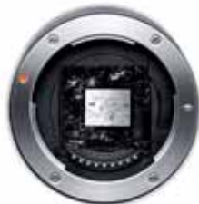
Lens change: dust particles have landed on the dust filter in front of the image sensor.