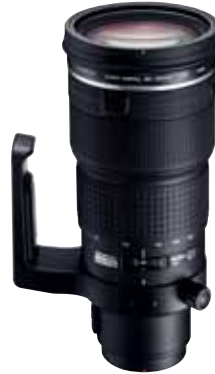
ZUIKO DIGITAL ED 90-250mm 1:2.8 (180-500mm)*